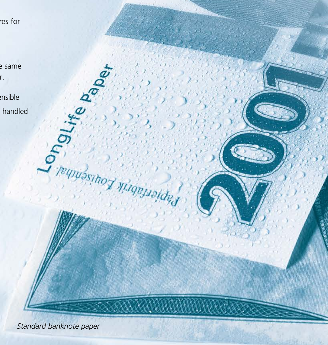
Standard banknote paper

Moisture repellent instead of moisture absorbent. In contrast with standard banknote papers, liquids bead on LongLife just as they would on the surface of an impregnated raincoat.